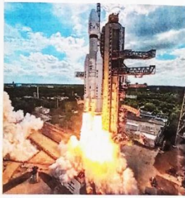
Ambitious mission: The rocket carrying Chandrayaan-3 lifts off from Satish Dhawan Space Centre in Sriharikota on Friday.

Speaking to reporters after the launch, ISRO Chairman S. Somanath said the next 42 days are crucial. "The landing is currently planned on August 23 at