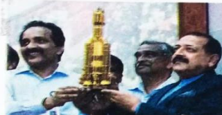
Limitless joy: Union Minister Jitendra Singh and ISRO Chairman S. Somanath addressing the media after the launch of Chandrayaan-3.

The EPO's closest approach to earth was around 170 km and farthest, at 36,500 km.