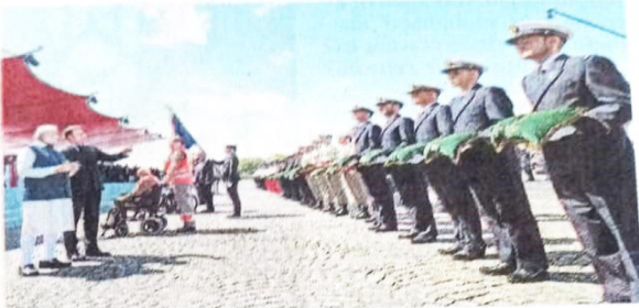
Prime Minister Narendra Modi and President Emmanuel Macron during the Bastille Day celebrations in Paris on Friday.